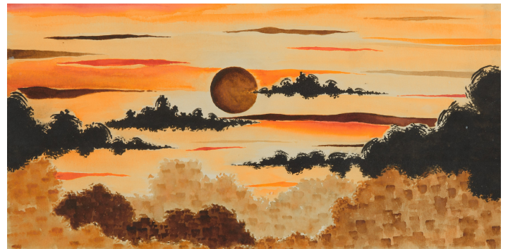
The Final Eclipse , Eli Lawson. Golding Showcase People's Choice Winner 2022