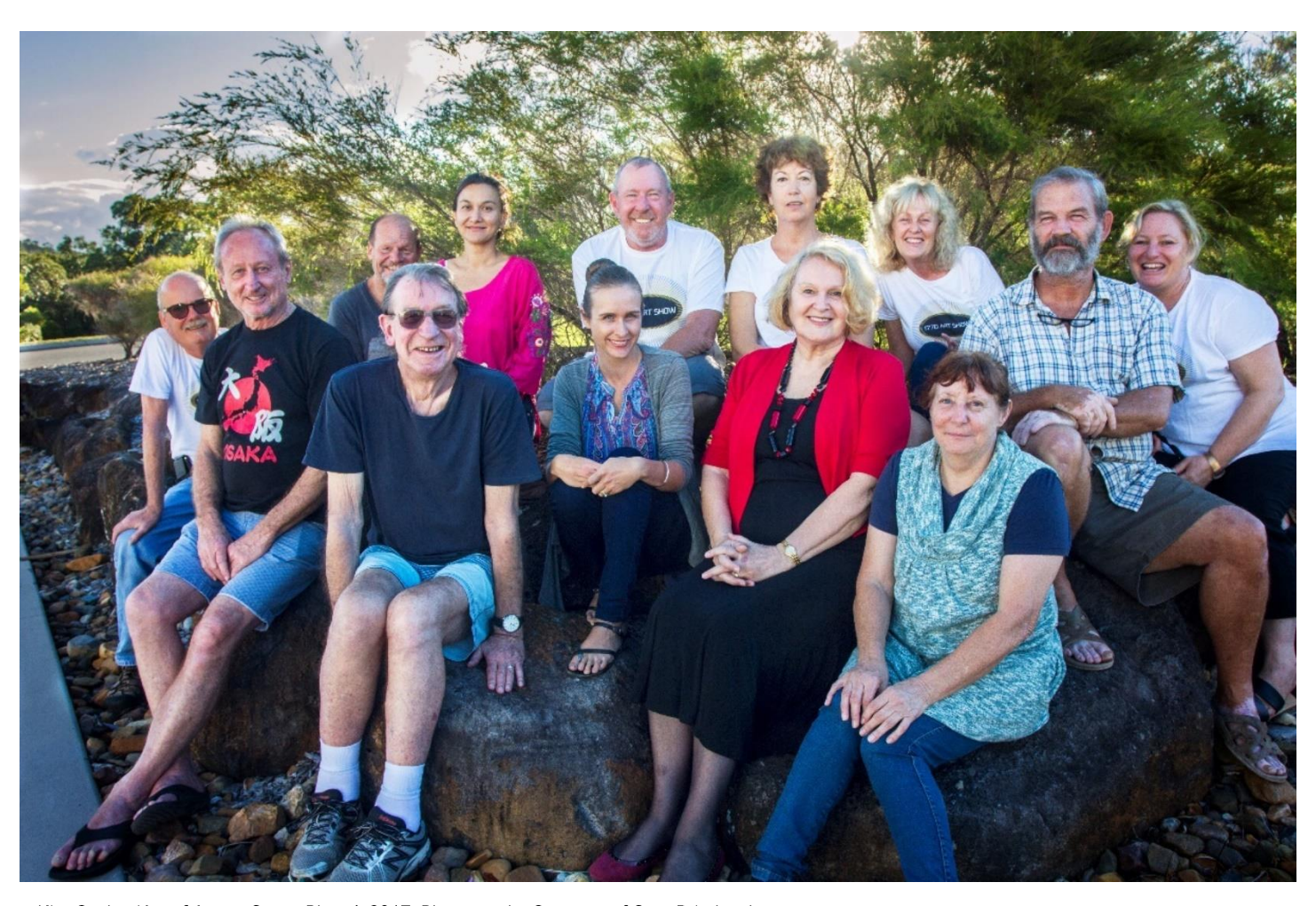
Kim Cooke, 'Art of Agnes Group Photo', 2017