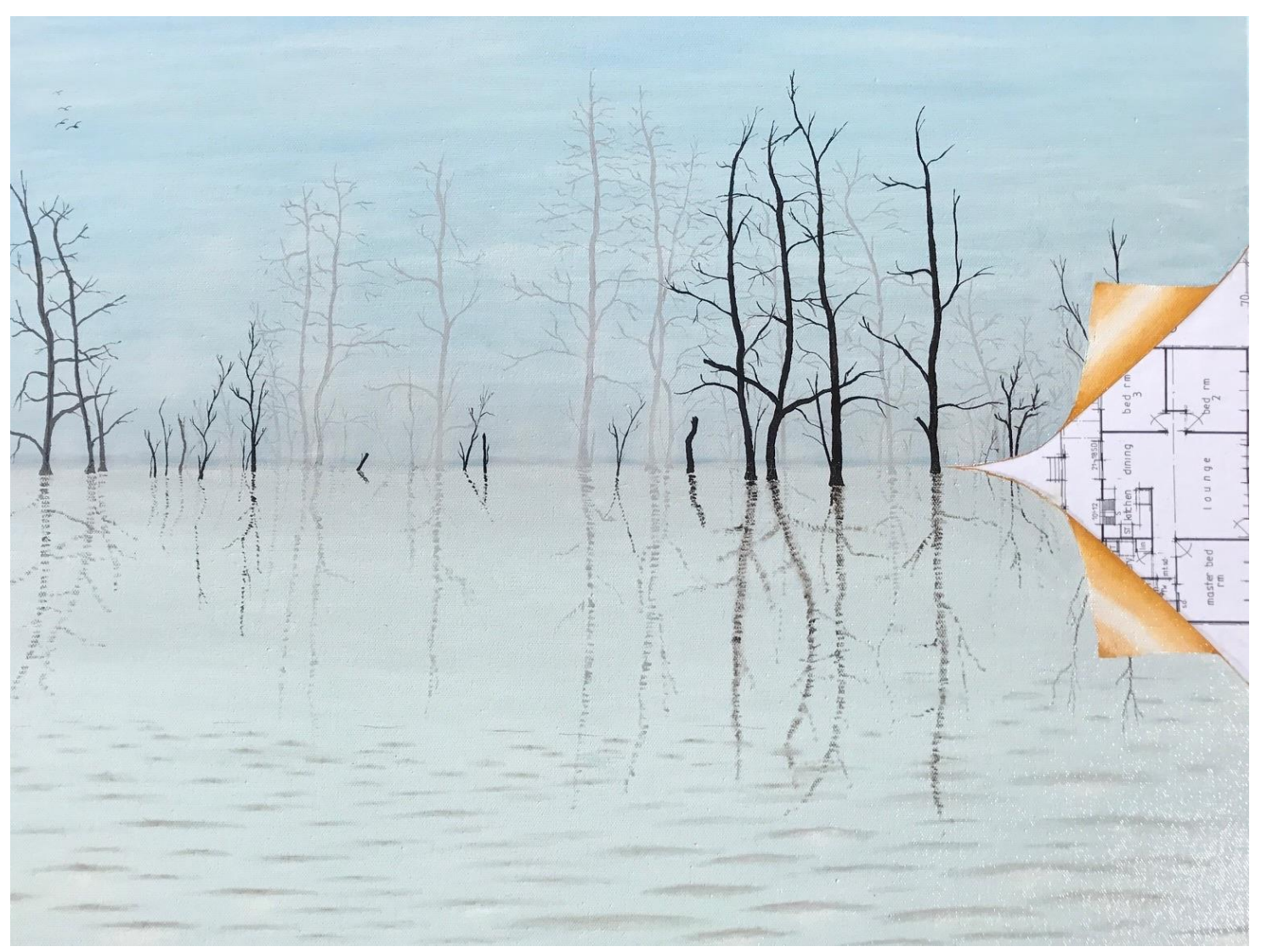
David Allen, 'Progress', 2017, oil and paper on canvas, Photograph Courtesy of the Artist