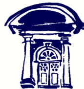
Gladstone Regional Art Gallery & Museum Society