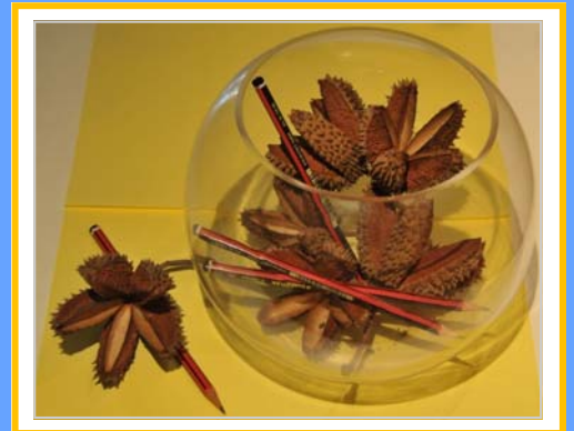
Image: Flindersia Australis seed pods, commonly known as Crows Ash.

Exhibition on display until 3 April 2013