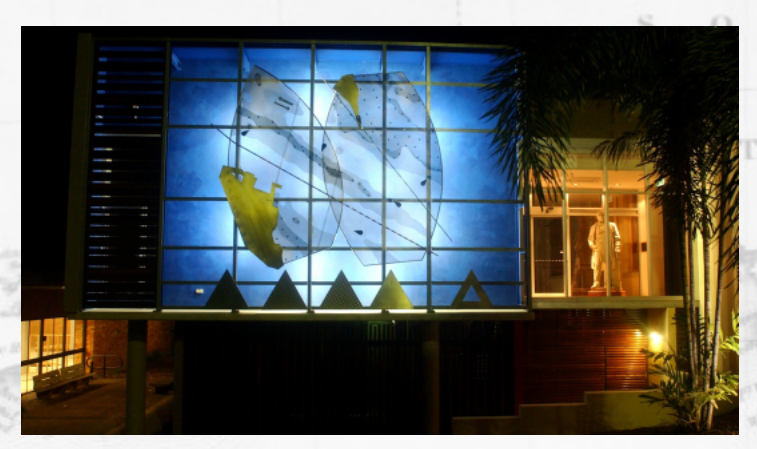
Gladstone Regional Art Gallery and Museum façade lights up at night with local artist Margaret Worthington's installation 151.16S 23.50E and the statue of William Ewart Gladstone.

Mr Gladstone's statue now enjoys views out to Goondoon Street and is an integral part of the City Heart streetscape. State of the art lighting makes it possible for the statue to be viewed by passers by at any time of day and night.