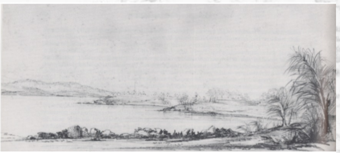
Pencil sketch of Port Curtis by George Barney, 1847.

Following the establishment of the first convict settlement at Port Jackson (originally at Botany Bay) in 1788, a second settlement was established at Van Diemen's Land (Tasmania) in 1803. By the early 1820s the flow of convicts was such that the British government decided to establish another penal colony.