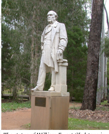
colony's centenary The statue of William Ewart Gladstone in the Tondoon Botanic Gardens

The reserve, created Governor Macquarie in 1887 was to be a grand park for the people to celebrate the and featured more than 31 statues.