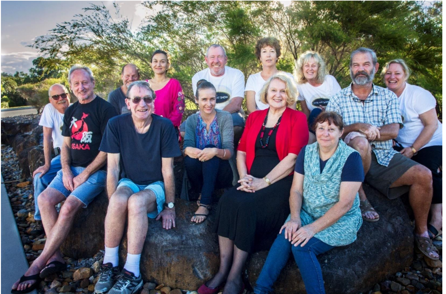
Kim Cooke, 'Art of Agnes Group Photo', 2017