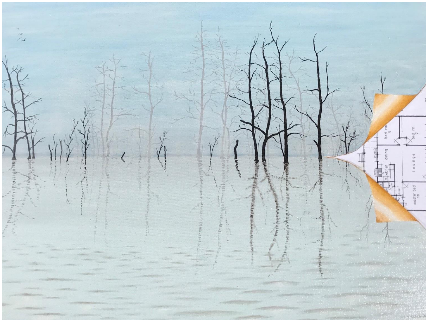
David Allen, 'Progress', 2017, oil and paper on canvas