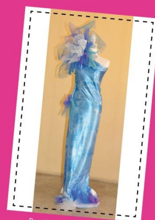
Beryl WOOD, Water Lily 2016

Exhibition launch: 6pm, Friday 3 March 2017