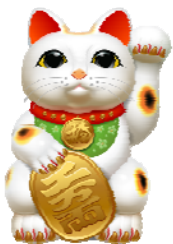
Japanese Lucky Cat

Bookings can be made via the Gallery/Museum: P: (07) 4976 6766 F: (07) 4972 9097 E: gragm@gladstonerc.qld.gov.au