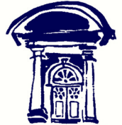
Gladstone Regional Art Gallery & Museum Society

It is recognised that students from this region have to leave the area to undertake tertiary studies in Visual Arts and this places an additional burden on them and their families. It is intended that the Gladstone Regional Art Gallery & Museum Society Golding Bursary will benefit such students.