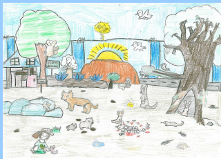
Lora Sumaya Warren Australian Outback (KKSS)