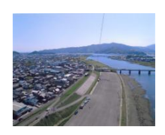
Motoyoshi Shiga Aerial View of Banjyo River