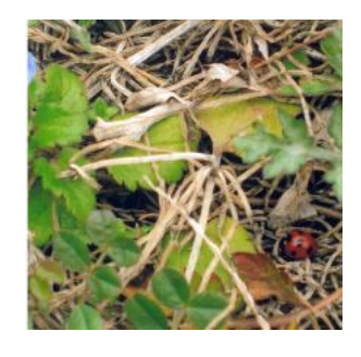
Chigusa Takezaki Early Spring