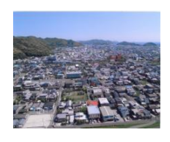
Motoyoshi Shiga Aerial View of Saiki City