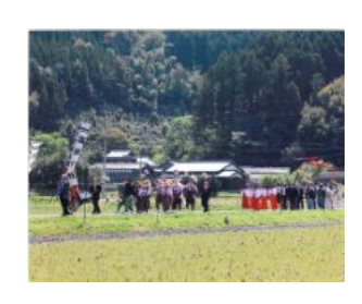
Takao Akimoto Tomio Shrine Festival