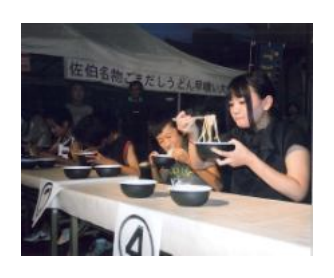
Toshihiko Takaji Gomadashi Udon Eating Contest