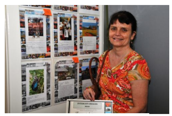
Roslyn House- Presentation of Certificates