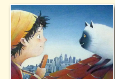
Left: 'Kookoo Kookaburra' by Gregg Dreise (Magabala Books, 2015).