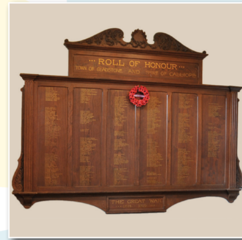
Left: Permanently displayed Roll of Honour: 'Town of Gladstone, Shire of Calliope, World War I'